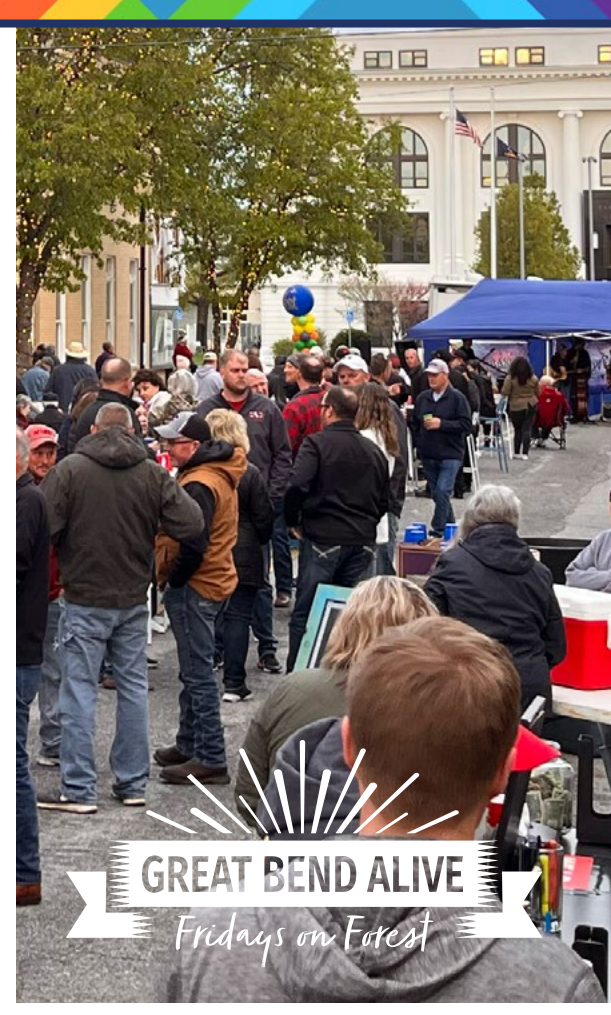
The photo above is from April 2023, a chilly start to the 2023 Fridays on Forest season. The Lovegrass Music Festival brought 3 bluegrass bands to the event. 43 degree-weather didn't scare off these folks. We are so grateful for the community for making these events awesome, no matter the temperature!

as gatekeepers for the evening. Fuel Barton County, dedicated to engaging and retaining young adults in Barton County, recognizes the significance of community involvement. Partnering with Fridays on Forest aligns with their mission, as it fosters a vibrant social scene and enriches the local community. By volunteering time, Fuel members not only contribute to the success