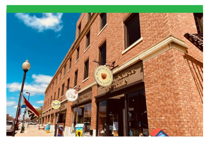
The Zarah will be renovating the 2nd and 3rd floors to create 24 residential units.

Visit <a href="https://www.gbedinc.com/downtowndevelopment">https://www.gbedinc.com/downtowndevelopment</a> for more information.