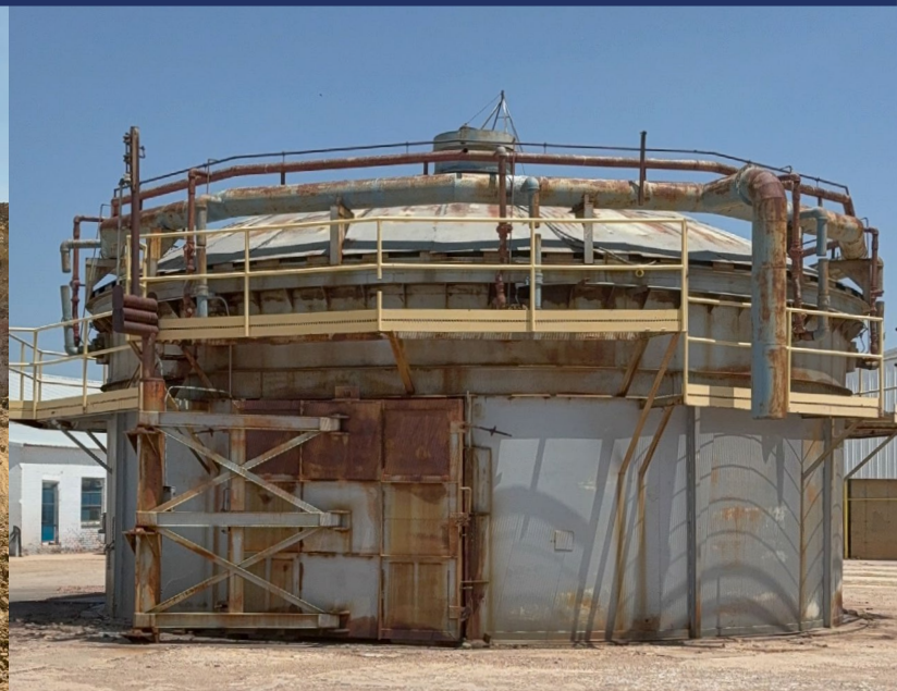
Left: One of the original clay pits between Great Bend and Hoisington—this high-quality Dakota Clay has powered production for over 70 years, with enough reserves to last for centuries. Right: One of the plant's earliest kilns, now retired, stands as a testament to 70 years of technological progress.

General Manager, 2010 Executive Vice President, 2025 President.