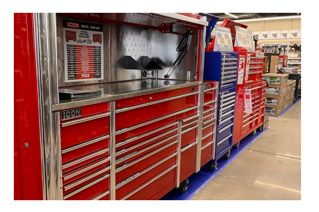
With core values of excellence and continuous improvement, Harbor Freight Tools works to constantly improve the quality of its products and this year will introduce more than 800 new tools and accessories.

This is our first location in Barton County, and we've been looking to open a location for quite some time. This is going to be much more convenient for our customers in Great Bend and in Barton County because currently our customers have to travel about 47 miles to our Hays location or 51 miles to our Hutchinson store.