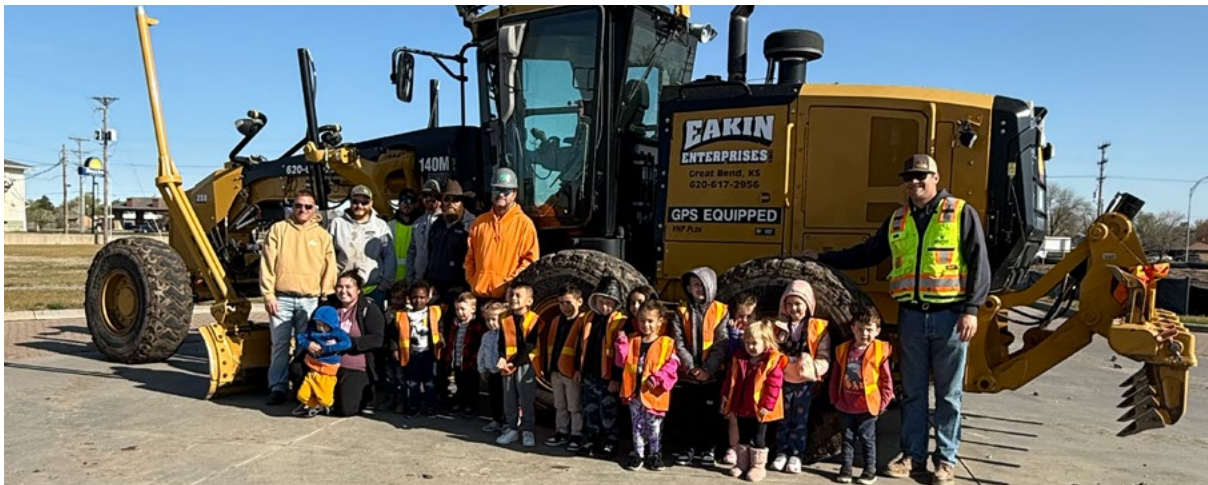
Future builders in the making! Students got to explore the big equipment they have been seeing across the street at the Innovation Center, one student exclaimed “that was amazing” as they walked back to the preschool.

The Innovation Center, once completed, will serve as a hub for business growth, education, and collaboration. Who knows—maybe one of these little learners will be designing their own projects here one day!