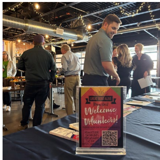
Curious new members visited with returning and original members of Great Bend Alive on the Volunteer Info Night at the end of March.

If you're ready to make a difference, sign up to volunteer by contacting us at [insert contact info] or visiting our