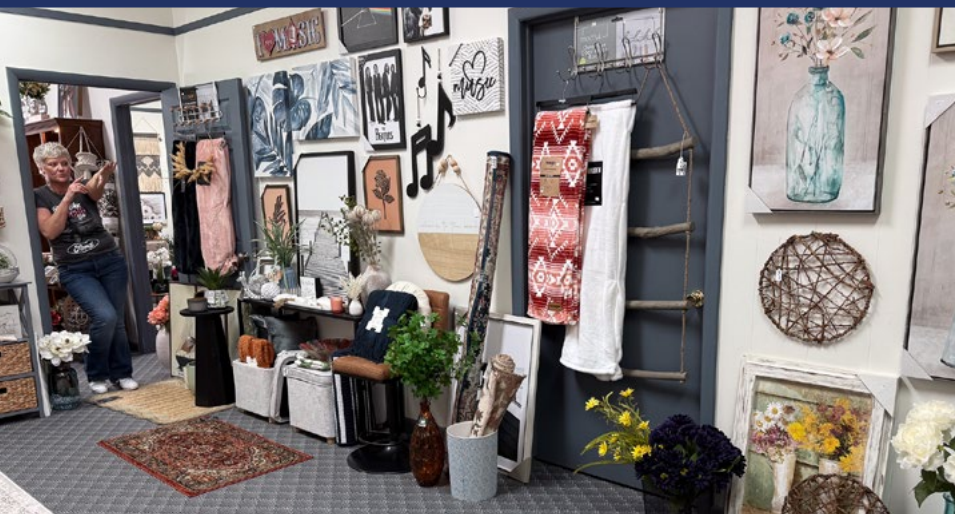
ReDirect Interiors—where faith, family, and style come together.