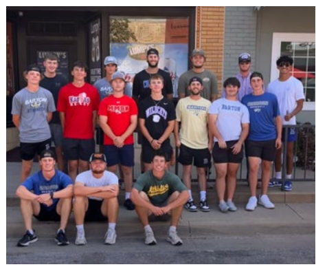
Big Shout Out to Barton's Baseball Team! Half the team set up our event in triple-digit heat, and the other half helped with tear down as a storm rolled on Forest Ave. Thank you, guys!

be on the east side of Forest. In addition to great music, attendees can also enjoy delicious food from Lumpy's, Los Dos Potrillo's, Flatlanders - Stone Fired Pizza, and The Spread Catering, and drinks from our alcohol vendors include: Los Dos Potrillo's, Lumpy's, Charlie's Place, and Dry Lake Brewing.