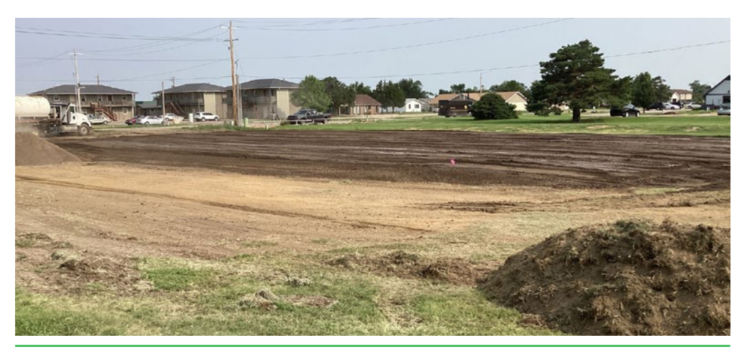
Advancing Barton County Childcare has officially broke ground as ICON Structures has started prepping sub-grade for the building pad! Both ICON and ABCC are excited to see this project kick off and start going vertical.

Thank you for your understanding, and please stay tuned for further updates, <u>www.gbedinc.</u> <u>com/abcc</u>.