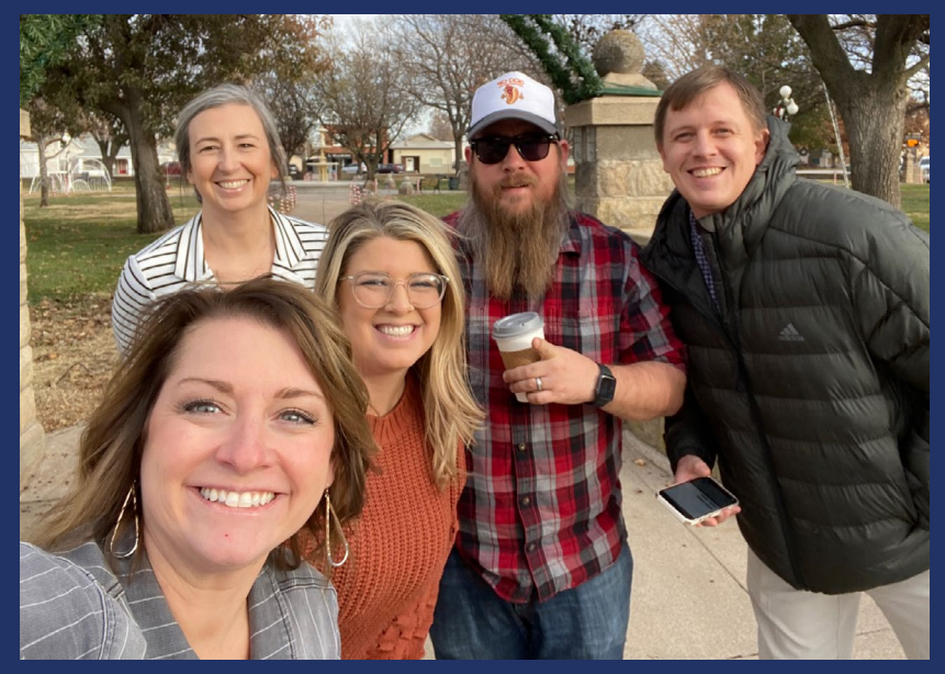
months, but are thrilled to have such a wonderful team to accept the challenge!

We look forward to sharing more information on this project in the coming