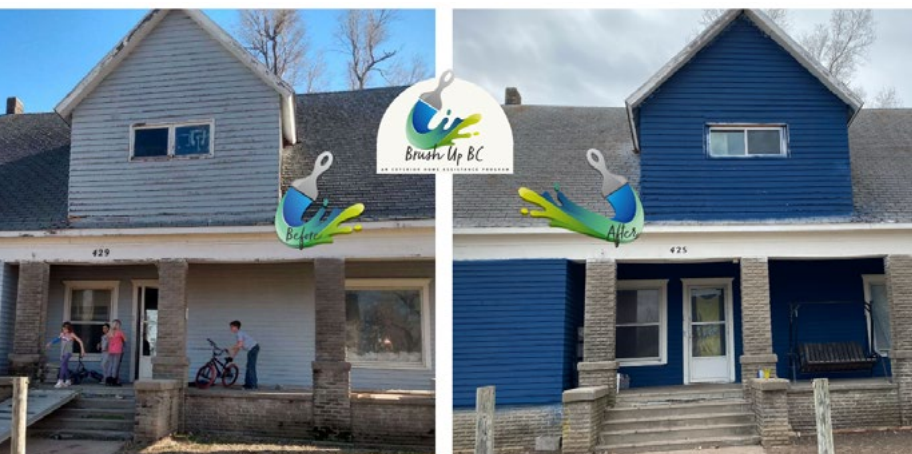
Brush Up BC programs sees another Pawnee Rock resident to take advantage of these grant funds.