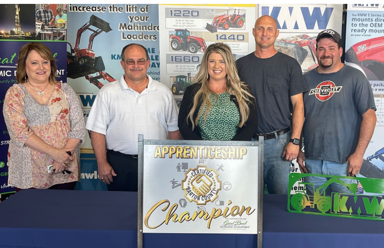
Apprenticeship Champion, KMW Loaders, was celebrated back in September of 2022 for starting what is now a successful apprenticeship program.