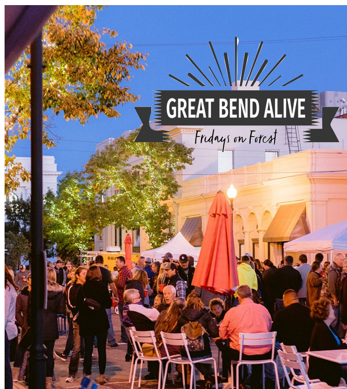
Another great season starts April 28th!

Sign up at: https://volunteersinaction.galaxydigital.com , and become a fan of Great Bend Economic Development to stay up to date on projects/events for which you can provide assistance. Another way to stay informed is to follow Great Bend Economic Development and Great Bend Alive on social media.