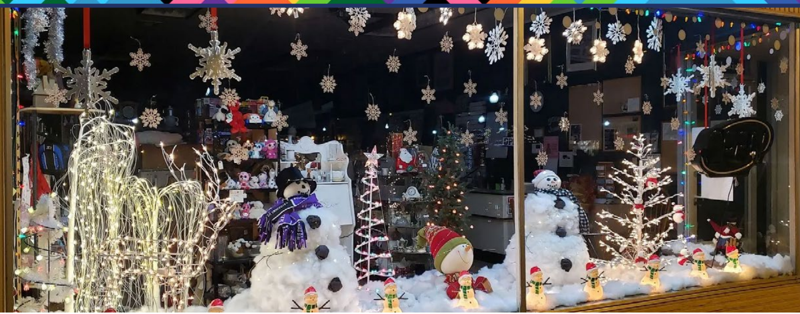
Great Bend Alive